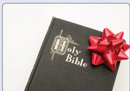
$ 10.00 #405 Bible. Give a child or youth his or her own copy of the Word of God or Bible handouts.