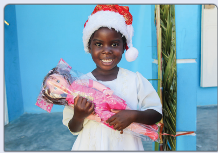
$ 5.00 #402 Christmas present for a child.