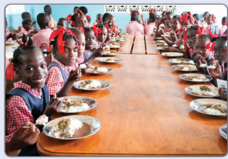
$ 10.00 #202 40 School lunches.