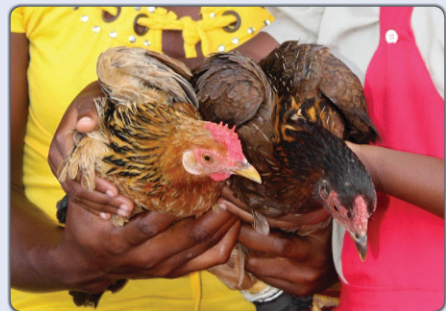
$ 20.00 #301 2 Chickens. Allow self-sufficiency for families; Part of "Pay it Forward" program.