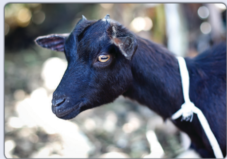
$ 70.00 #302 1 Goat. Help families breed success; Part of "Pay it Forward" program.