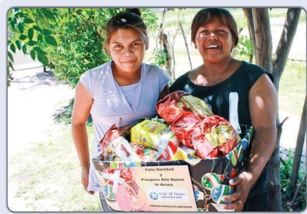
$ 25.00 #204 Food basket filled with rice, beans, oil, dried fish (hareng), sugar and kerosene for two days for a family of four.